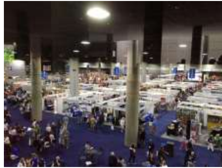
One of the convention floors

Annual Crab Fest: last Saturday in February Fiesta Los Alamos!: late July or early August