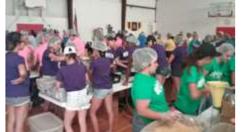
2 Hours Later: 42,000 Food Packages