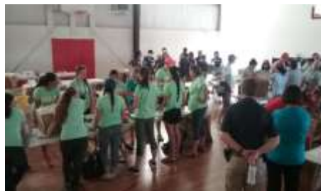
Packaging in Progress