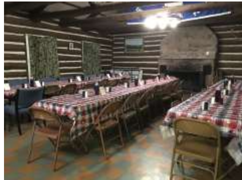
At the Bar